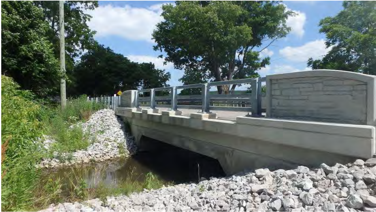
Figure 3 North Profile, Inlet