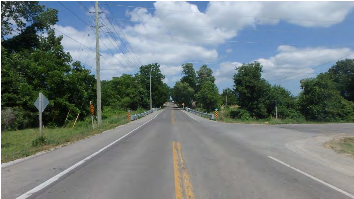
Figure 2 West Approach