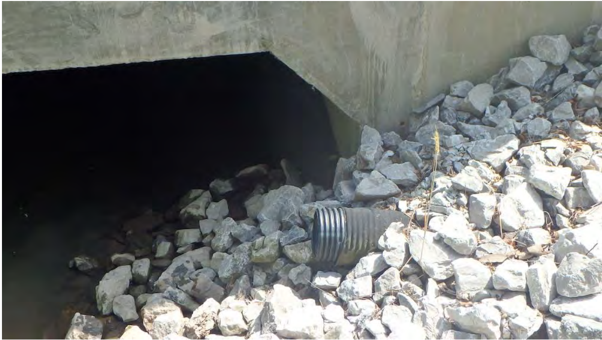
Figure 11 Typical Abutment Drain