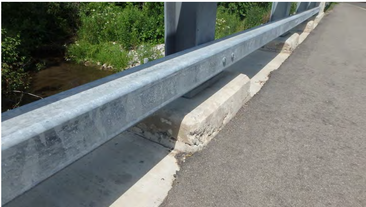
Figure 12 Typical Honeycombing on North Pedestals