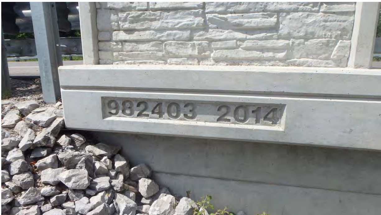
Figure 14 Structure Number and Date