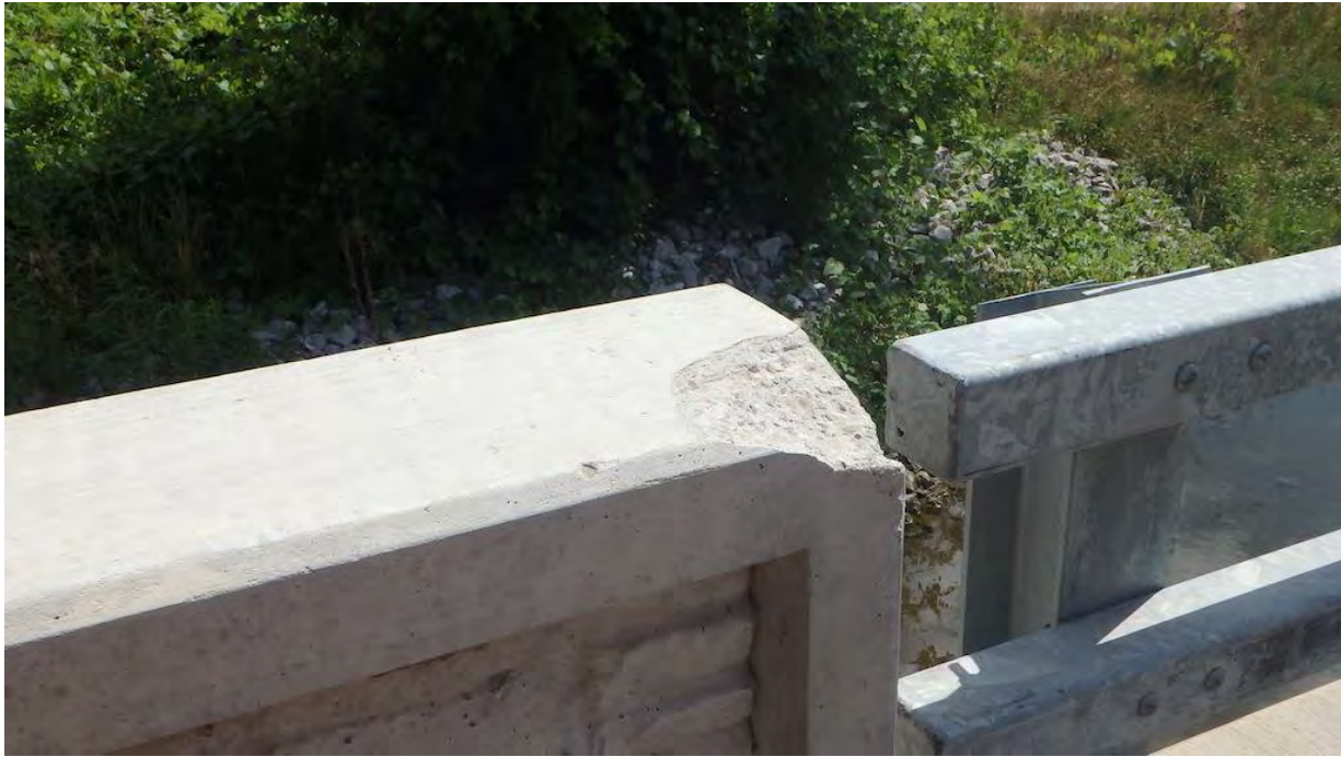
Figure 13 Impact Damage on South Endposts