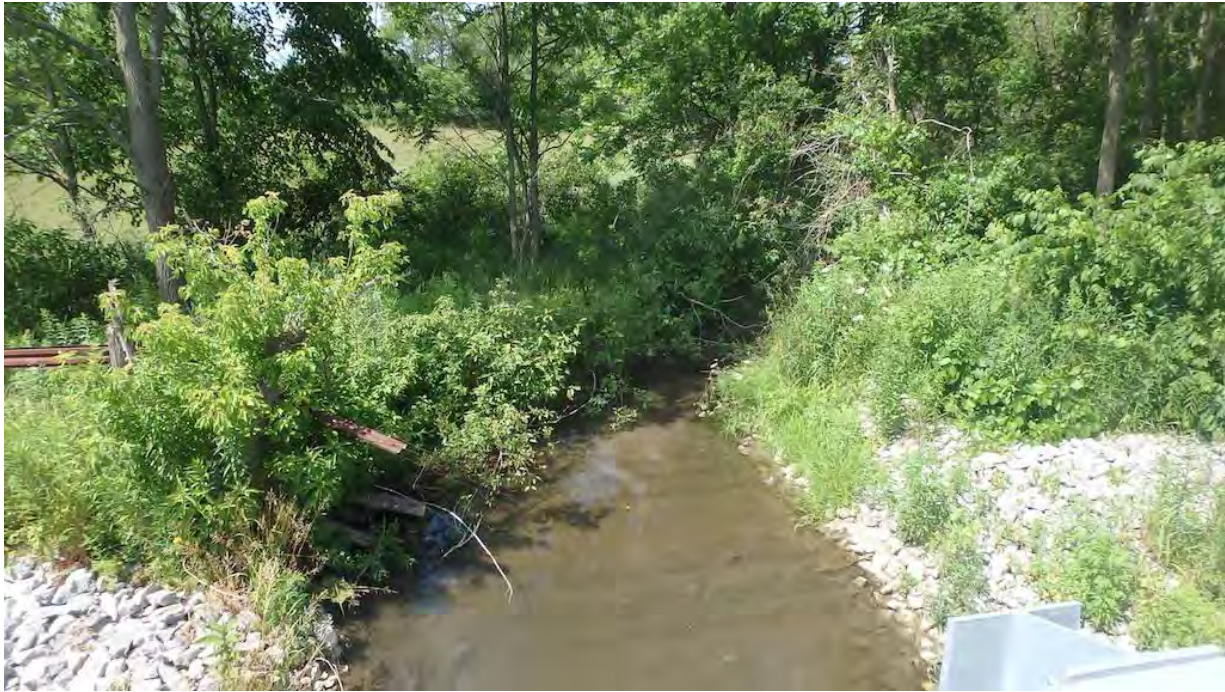
Figure 5 Upstream