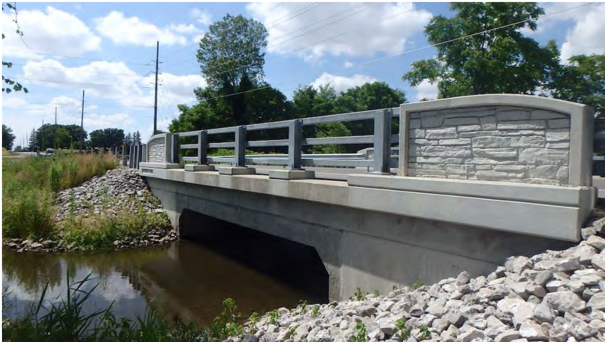
Figure 4 South Profile, Outlet