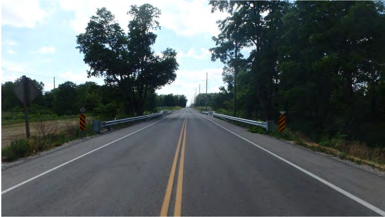
Figure 1 East Approach