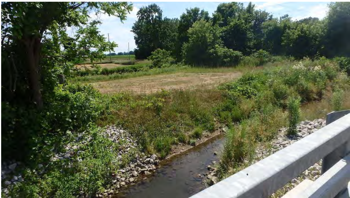
Figure 6 Downstream