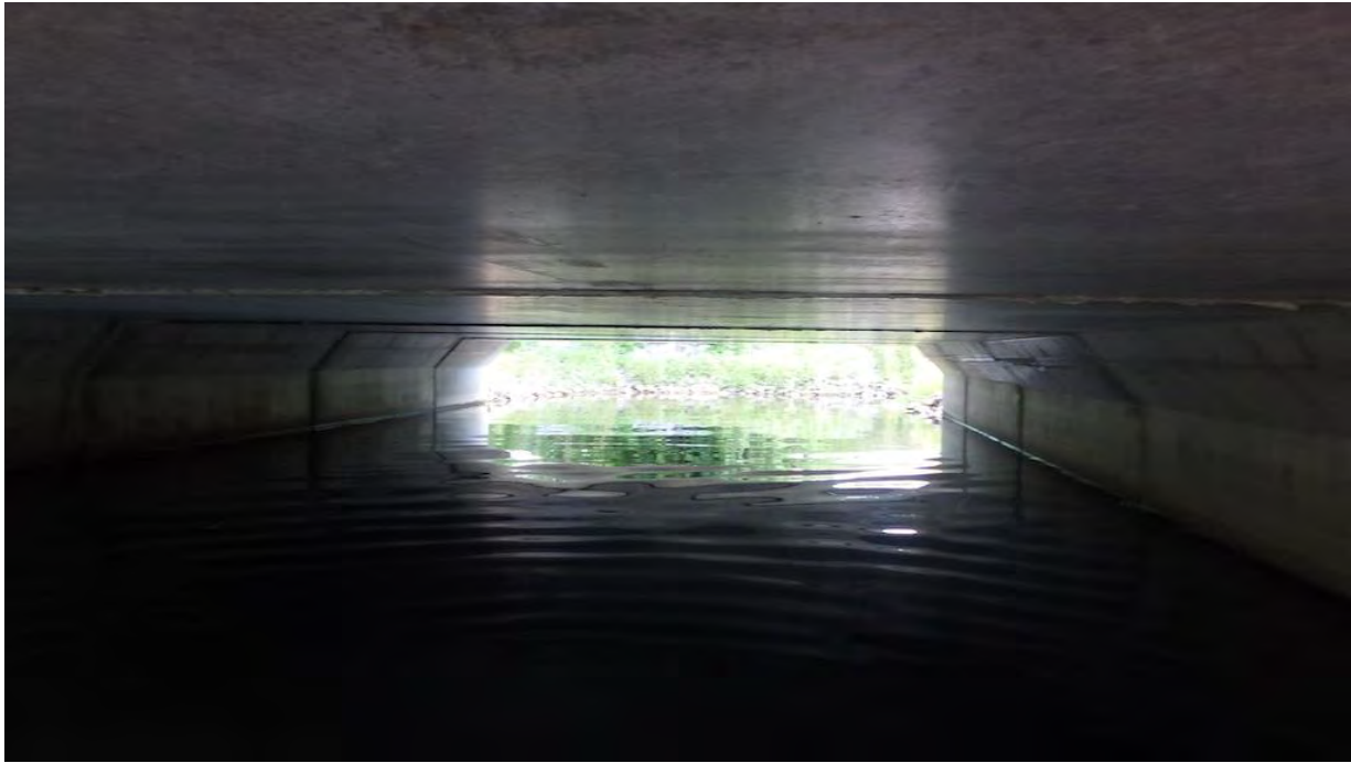
Figure 9 Barrel