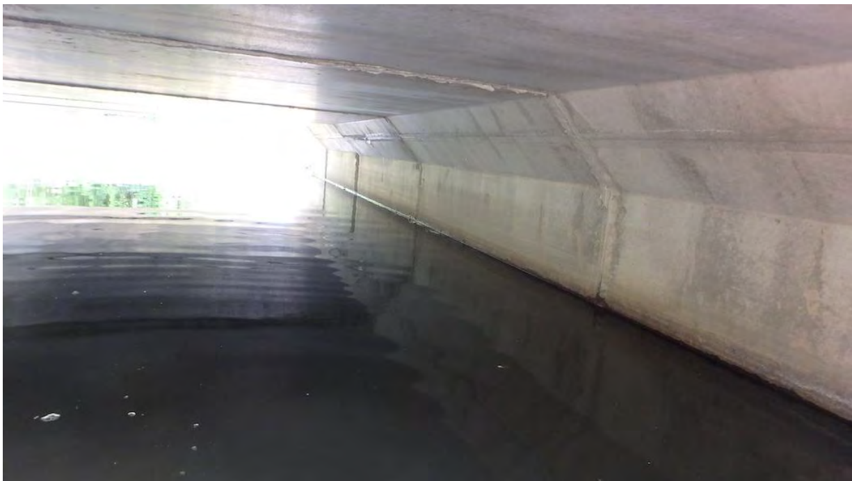
Figure 8 West Wall