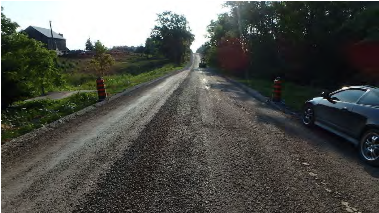
Figure 2 West Approach