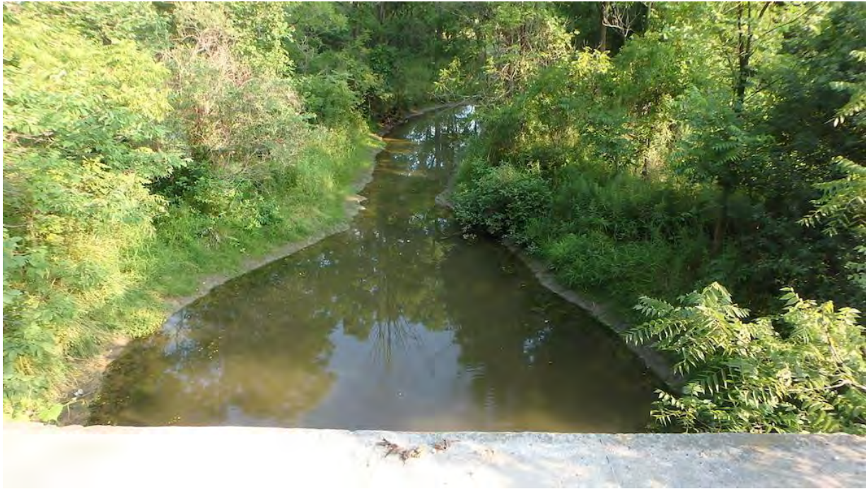
Figure 5 Upstream