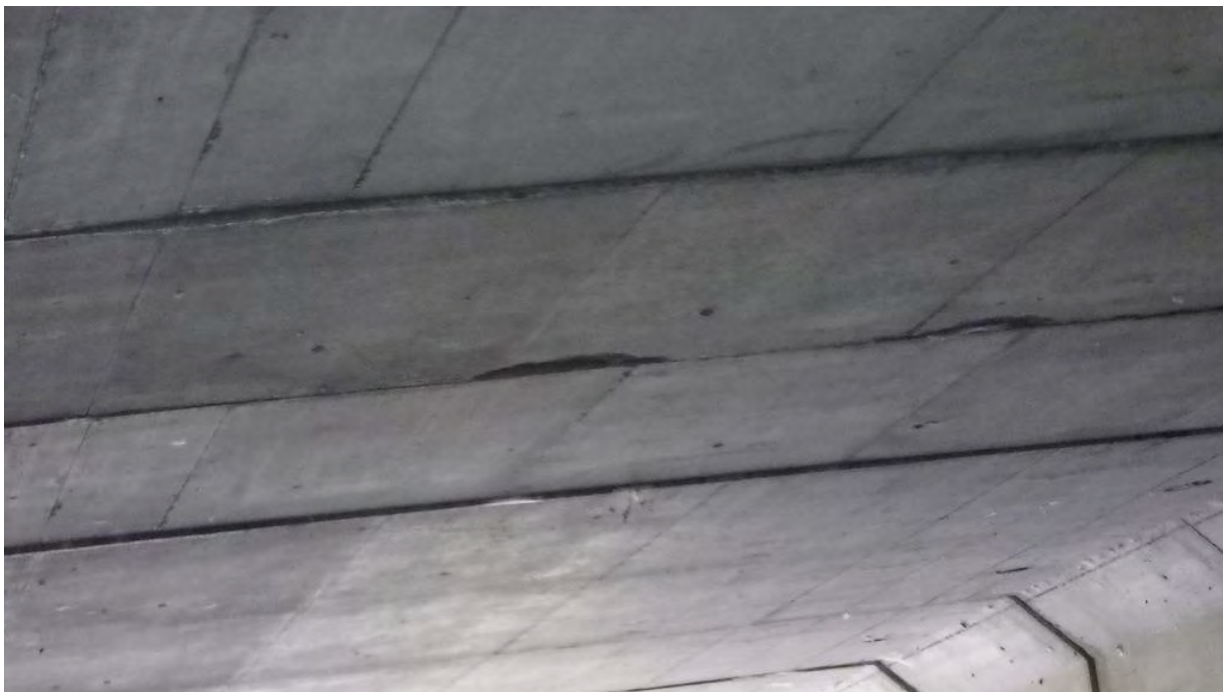
Figure 11 Spalling at Joint in Barrel