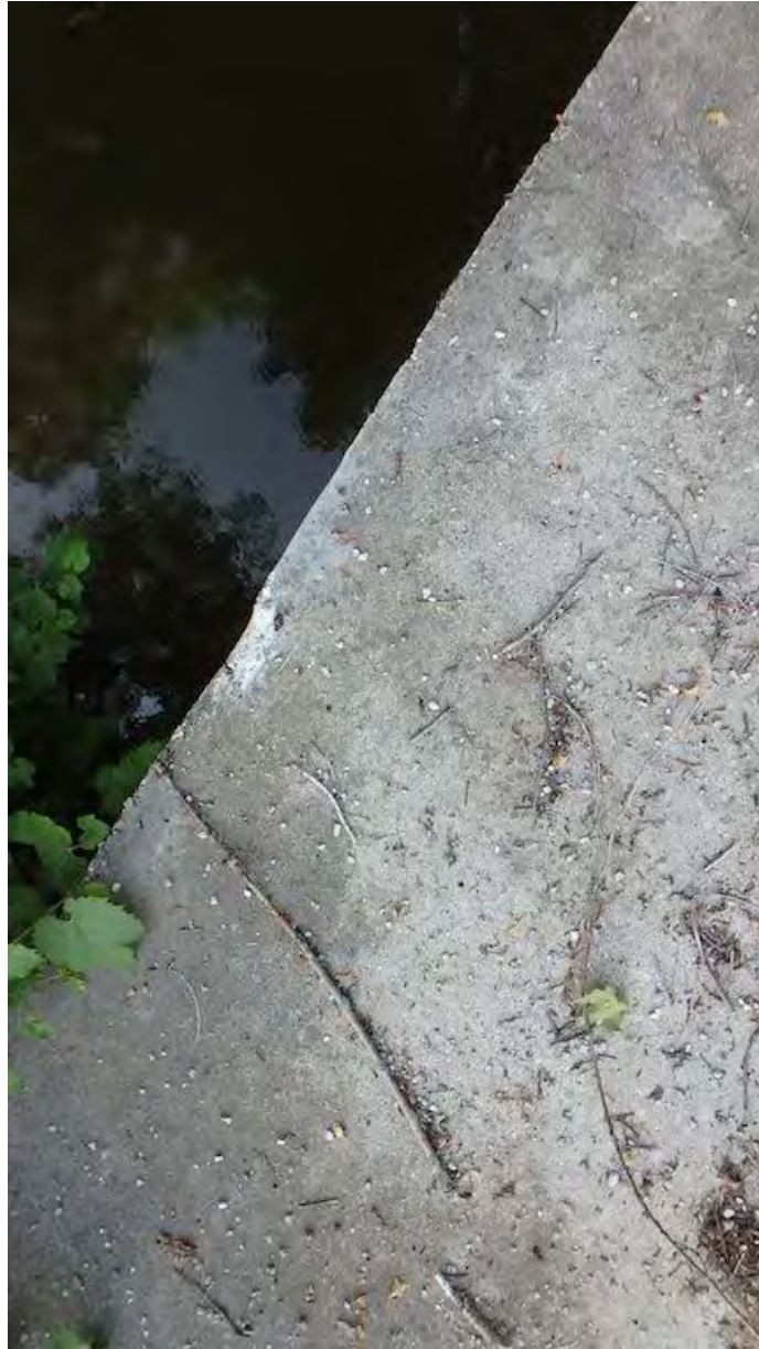
Figure 12 Spall at Outlet End