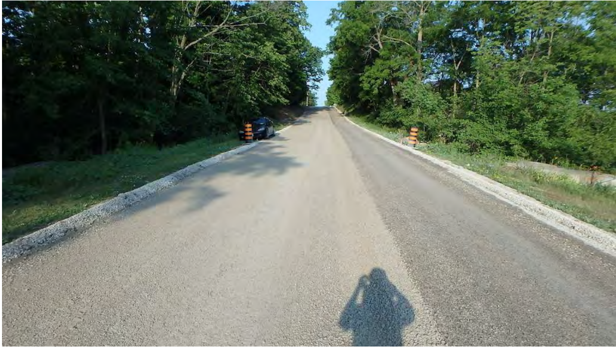
Figure 1 East Approach