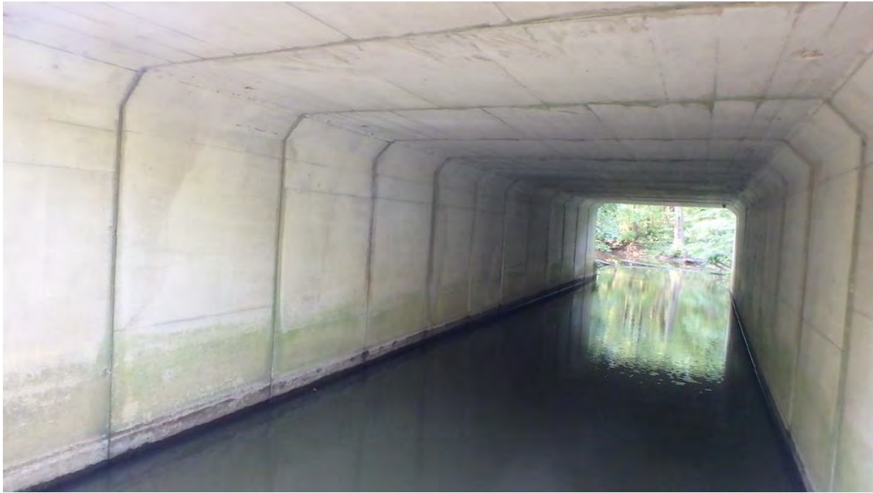
Figure 7 Barrel