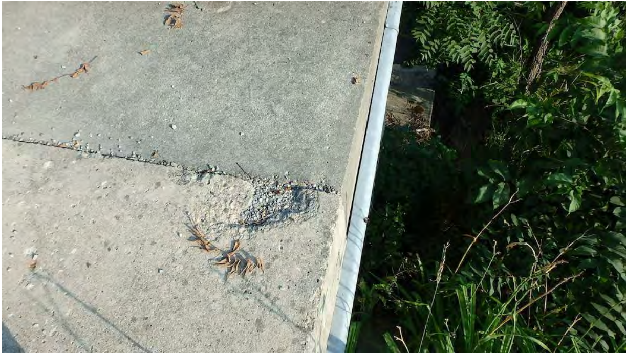
Figure 13 Scaling, Utility at Northwest Quadrant