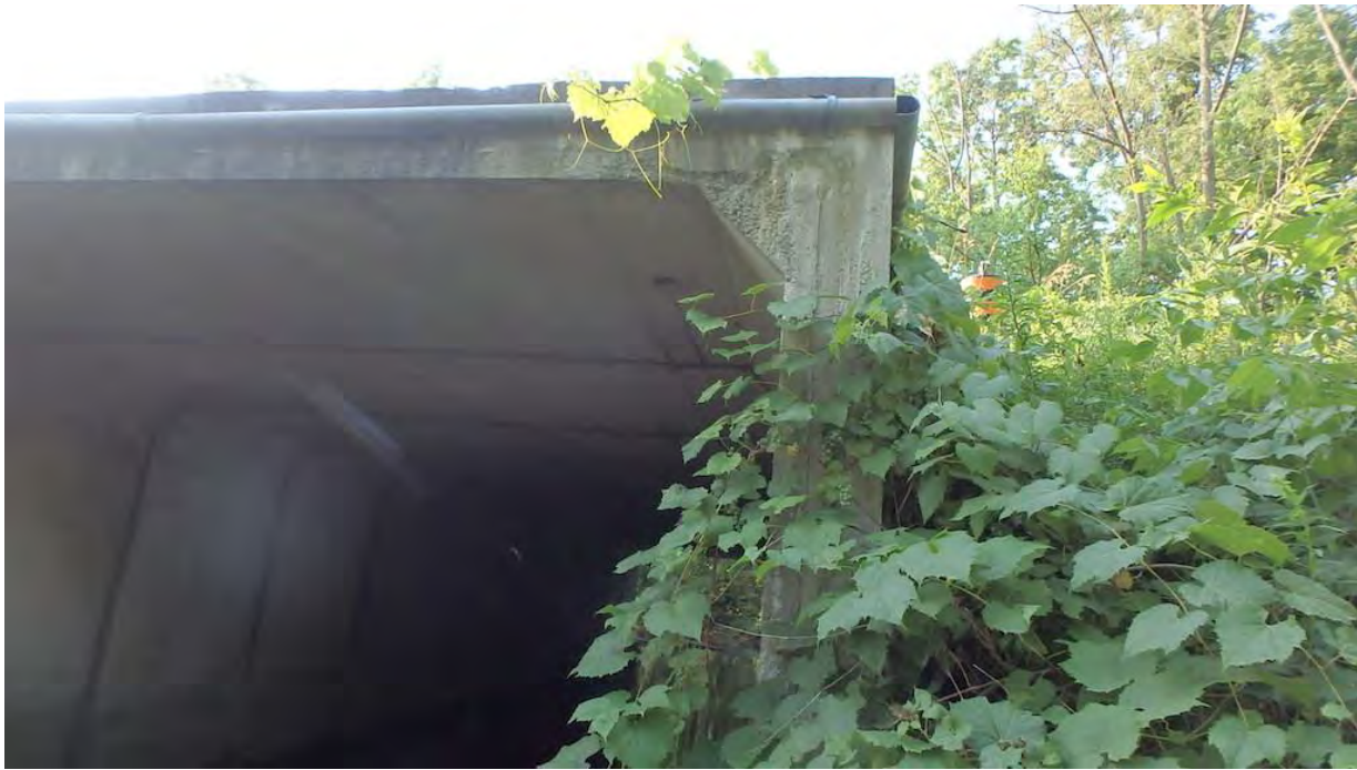
Figure 10 Scaling at Northwest Quadrant