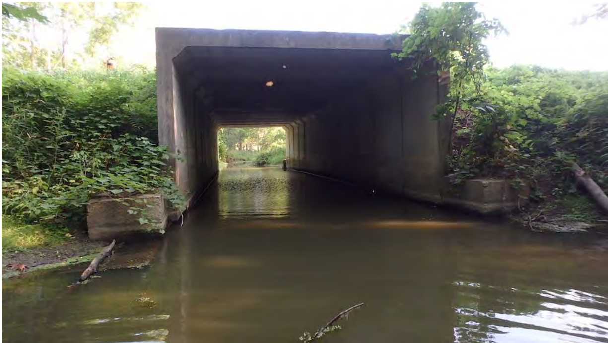
Figure 4 South Profile