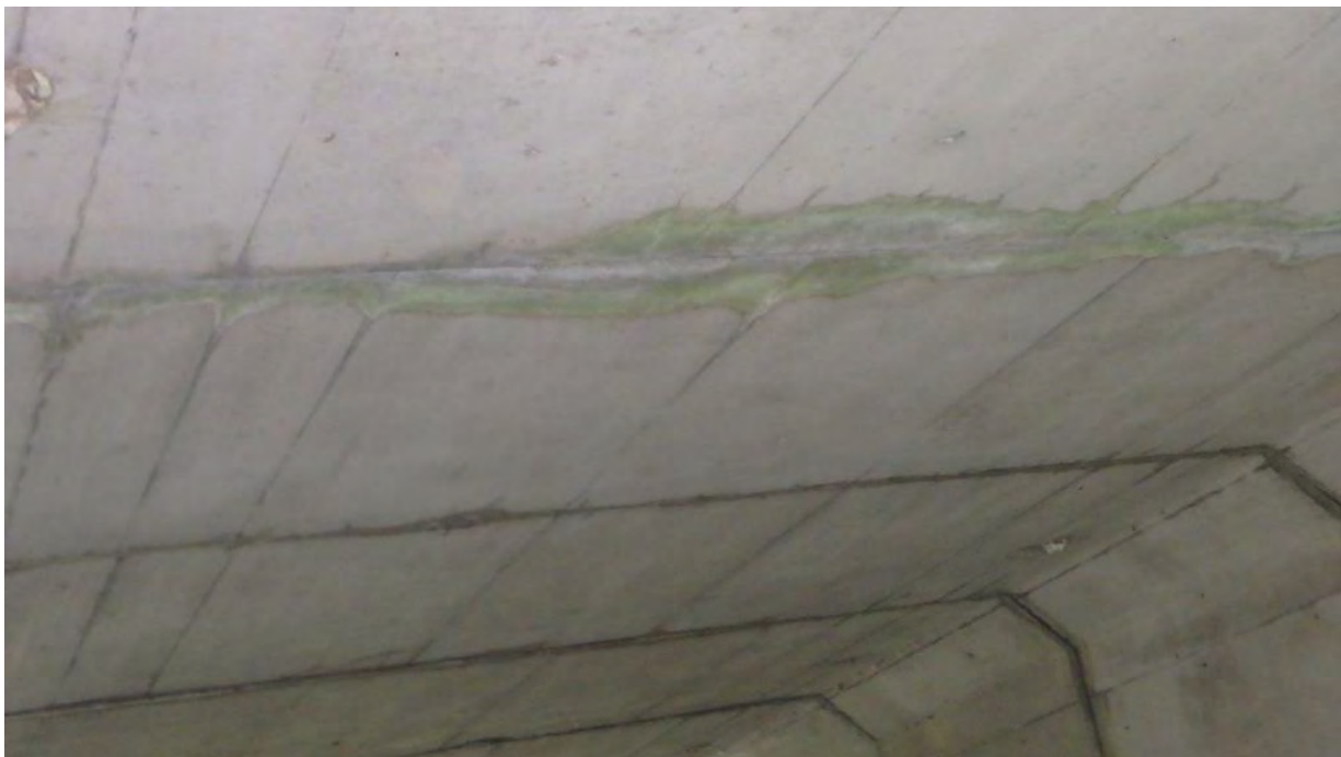
Figure 8 Leakage and Staining at South Joint