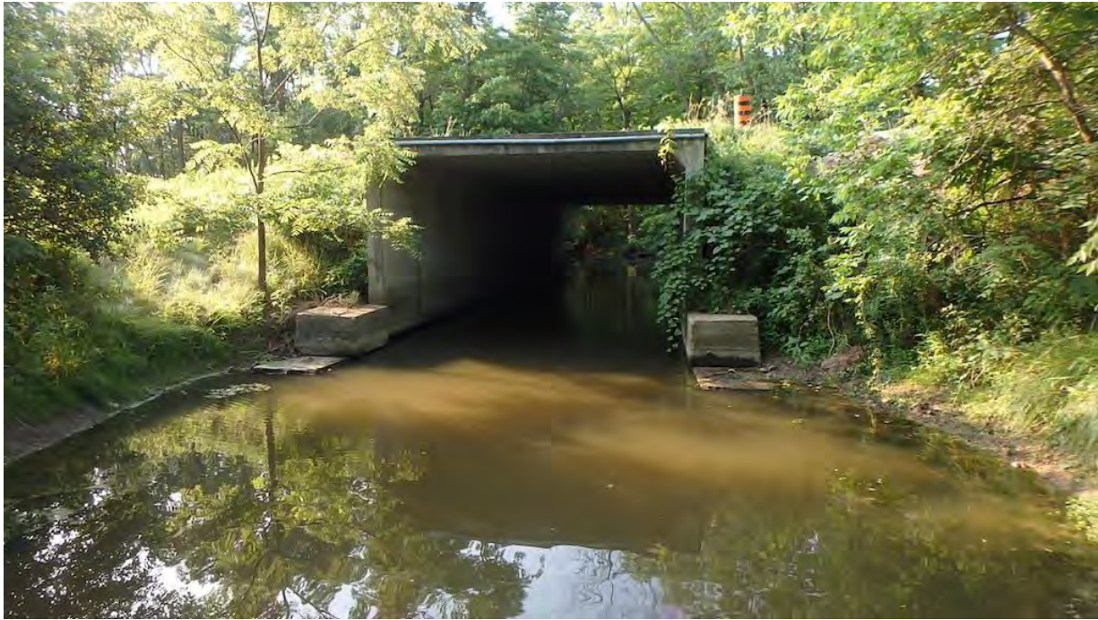
Figure 3 North Profile