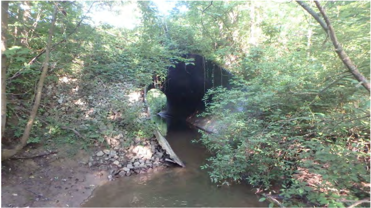
Figure 3 East Profile