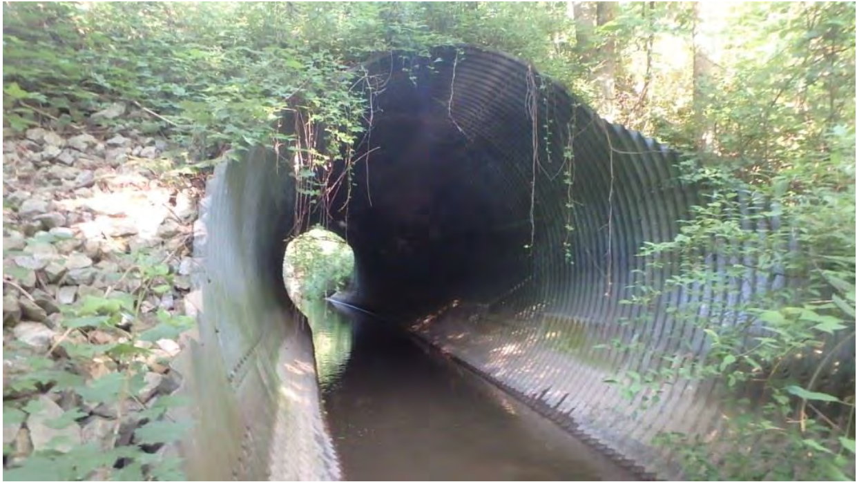
Figure 7 Barrel, Looking West, Note Culvert Out of Alignment