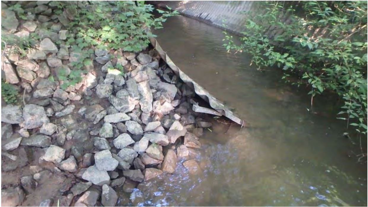
Figure 9 Minor Undermining at All Quadrants