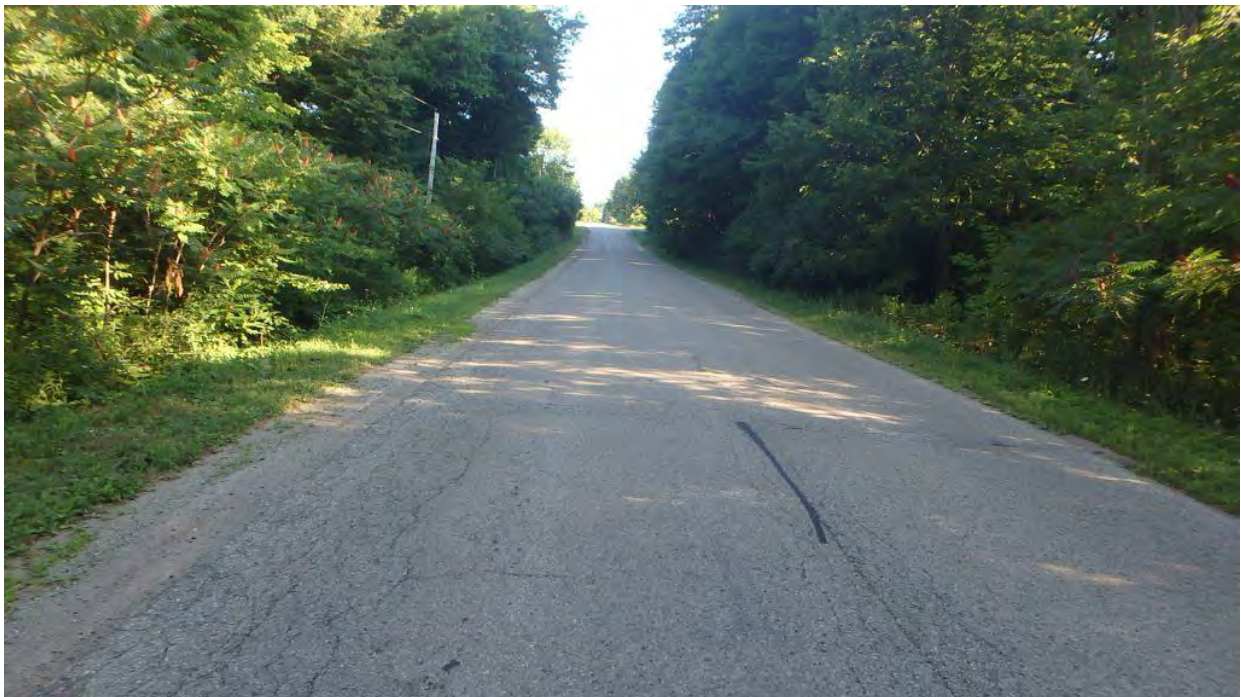
Figure 2 South Approach