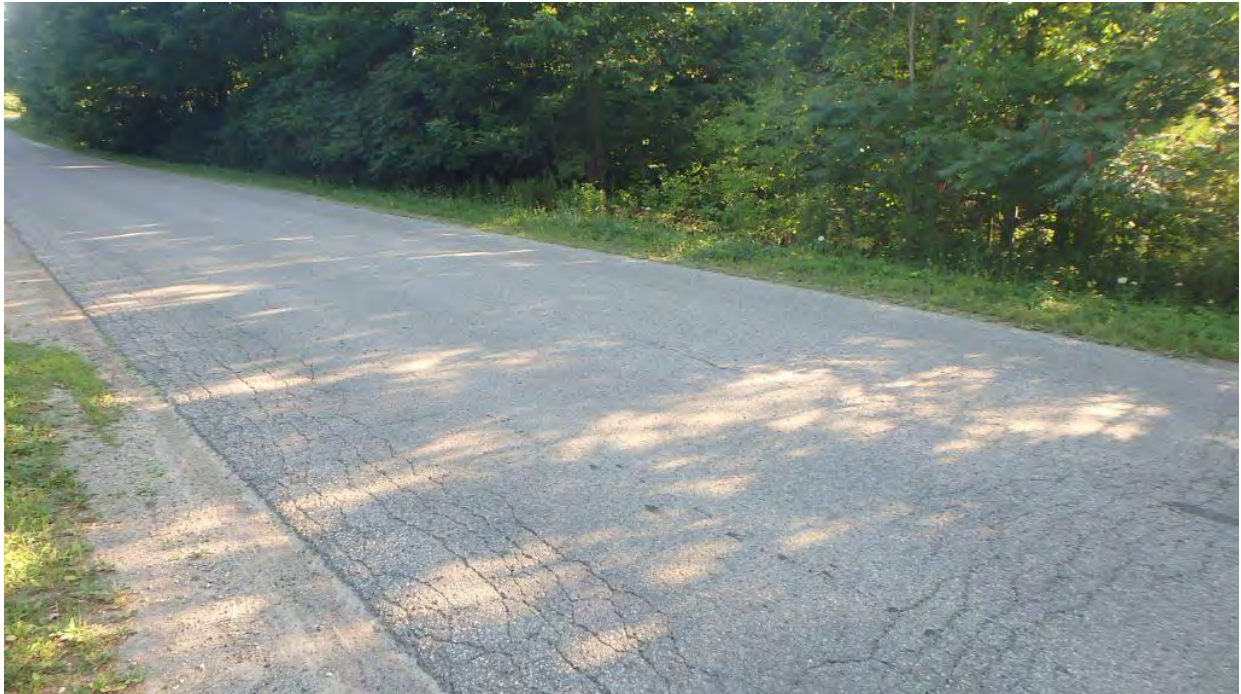
Figure 10 Asphalt Wearing Surface, Note Cracking