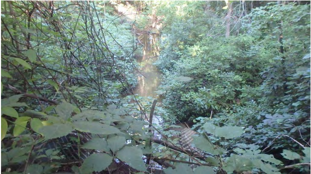
Figure 6 Downstream