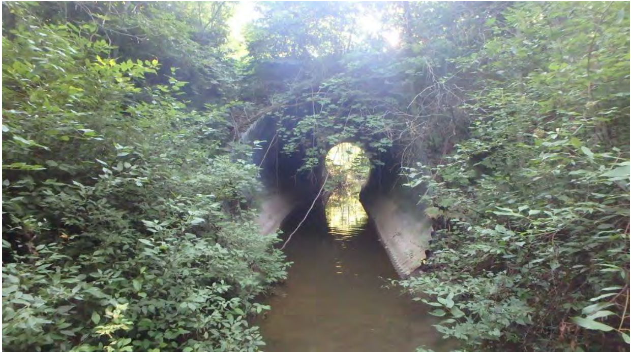
Figure 4 West Profile