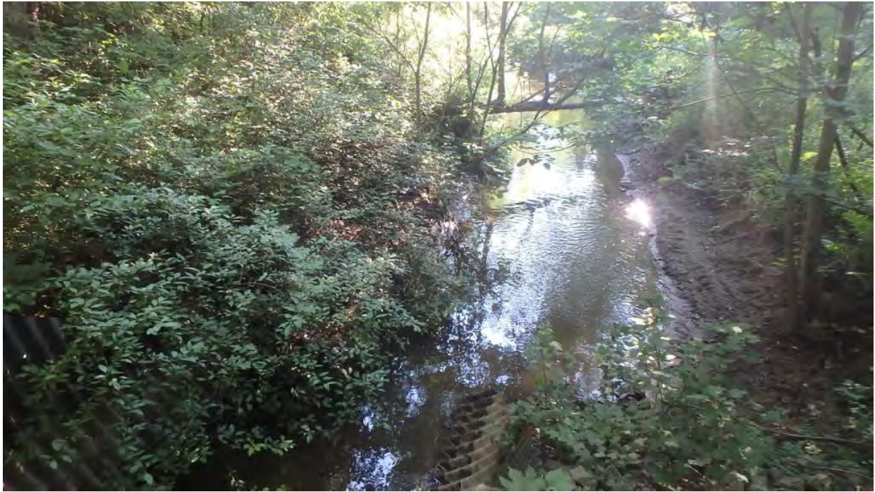
Figure 5 Upstream