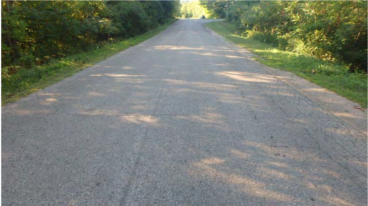
Figure 1 North Approach