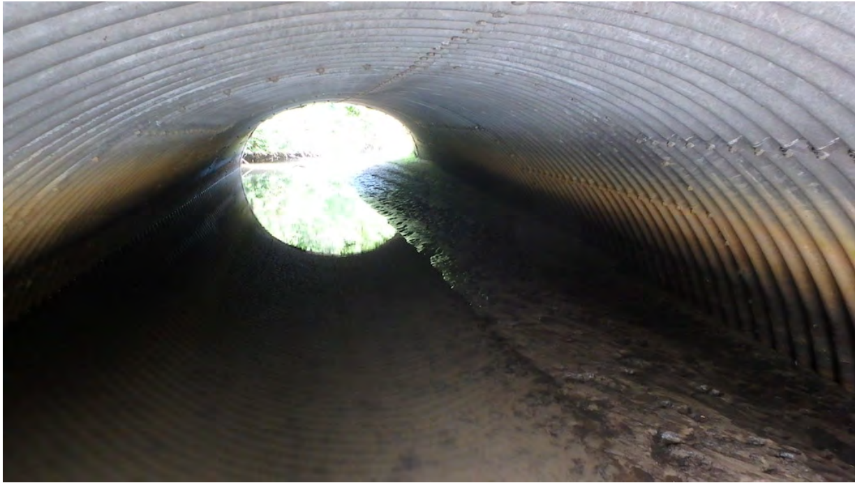
Figure 7 Barrel, Looking West