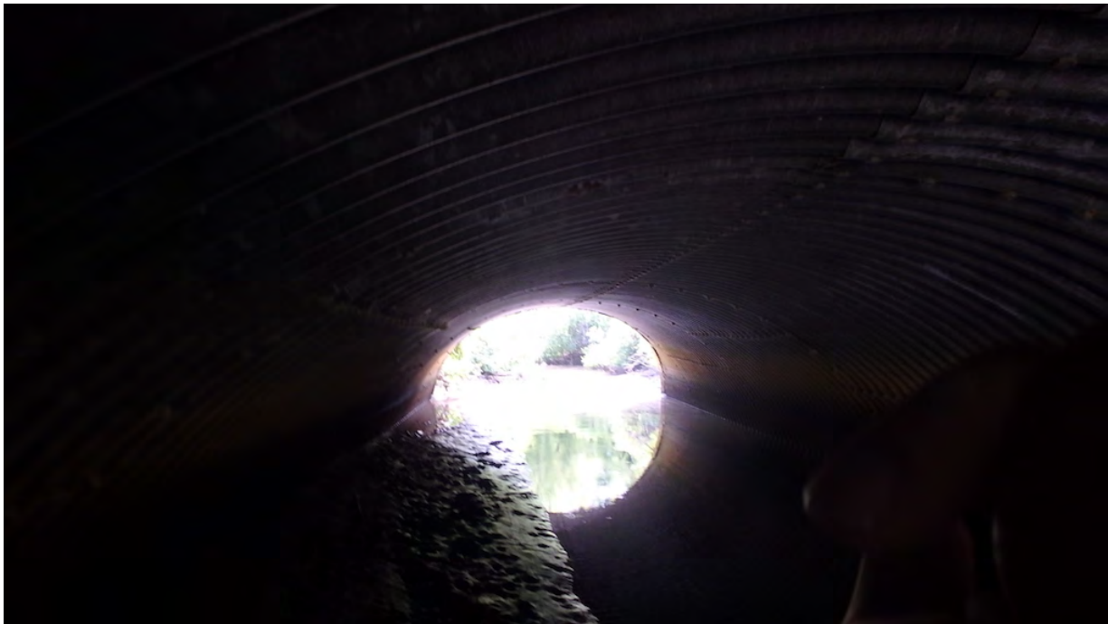
Figure 6 Barrel, Looking East