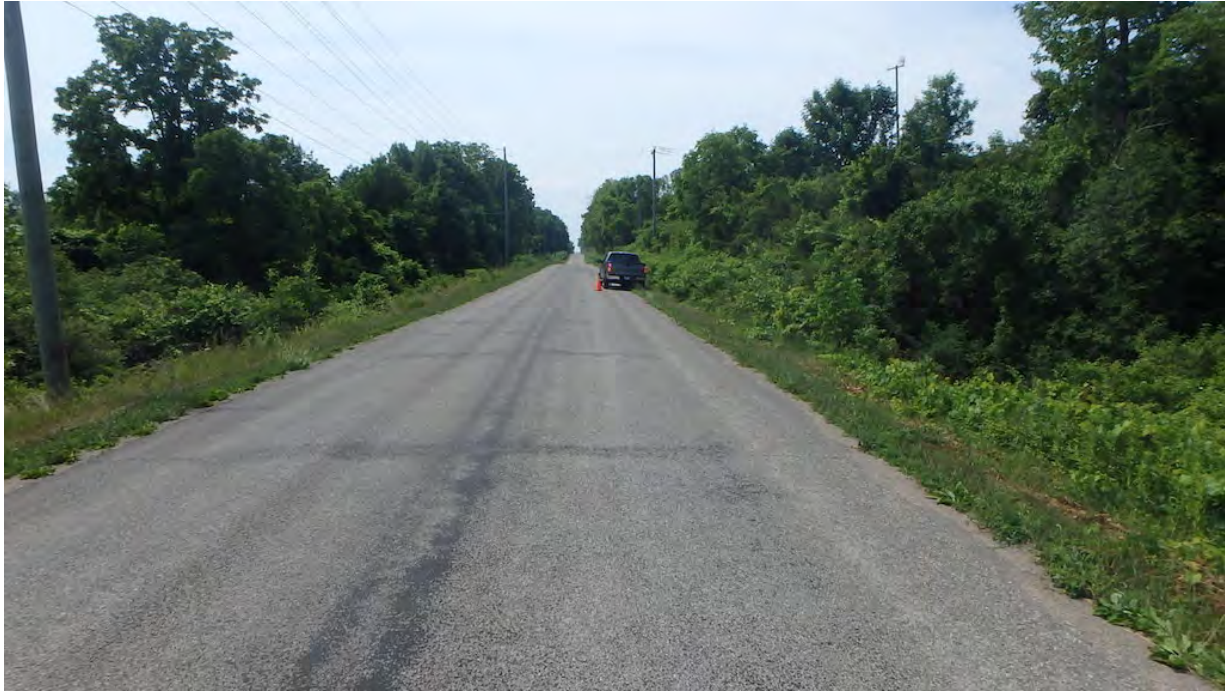
Figure 1 North Approach