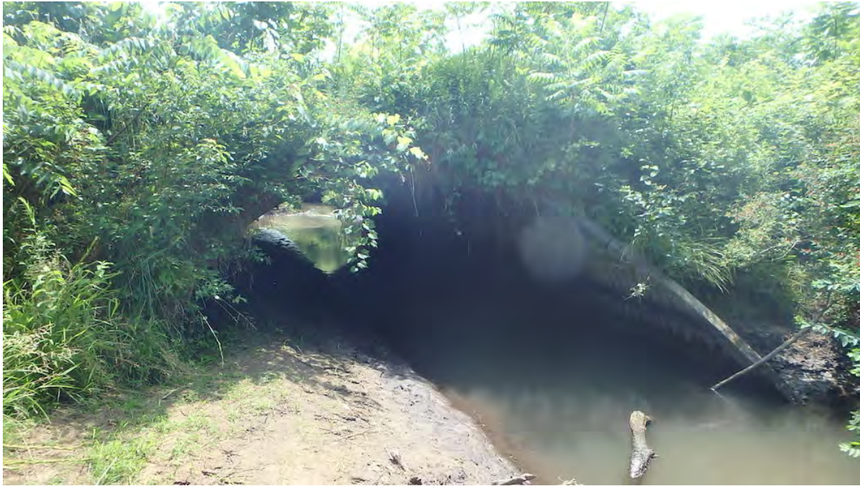
Figure 3 West Profile