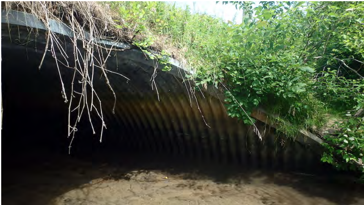
Figure 10 Wingwall, Note Corrosion