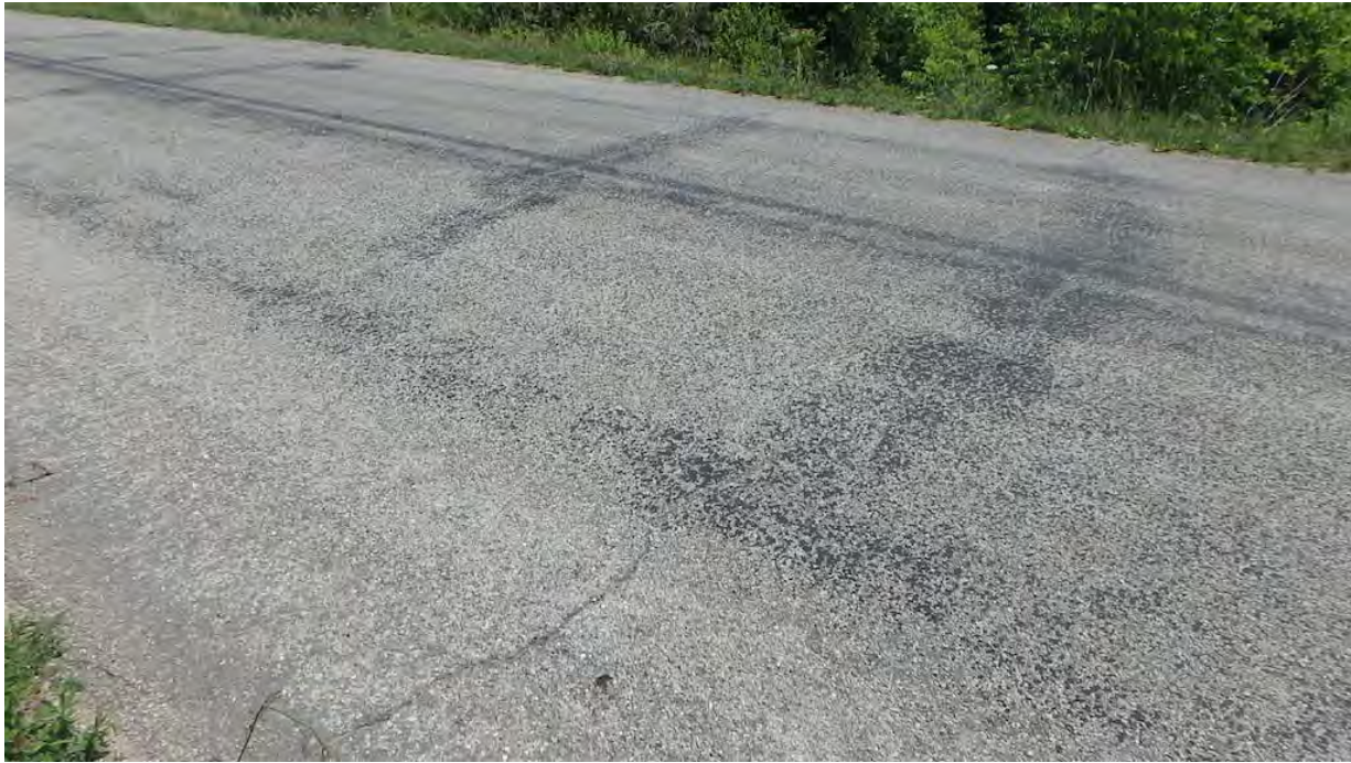
Figure 11 Transverse Cracks and Polishing of Wearing Surface