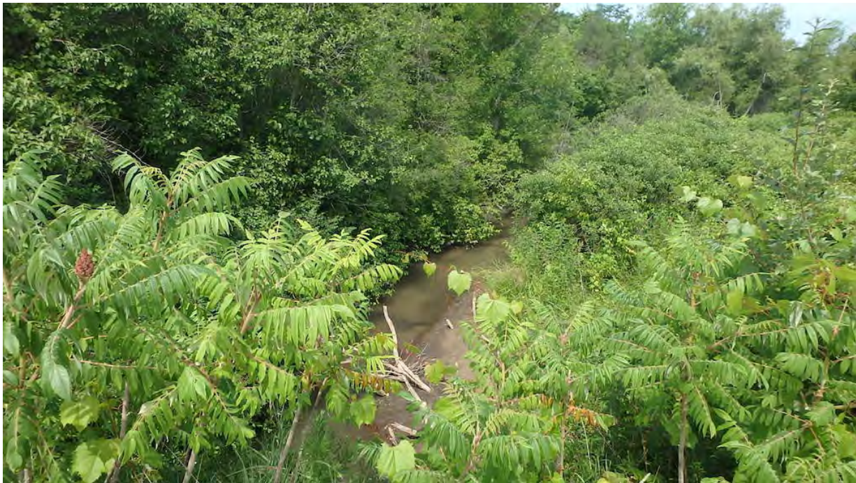
Figure 4 Upstream