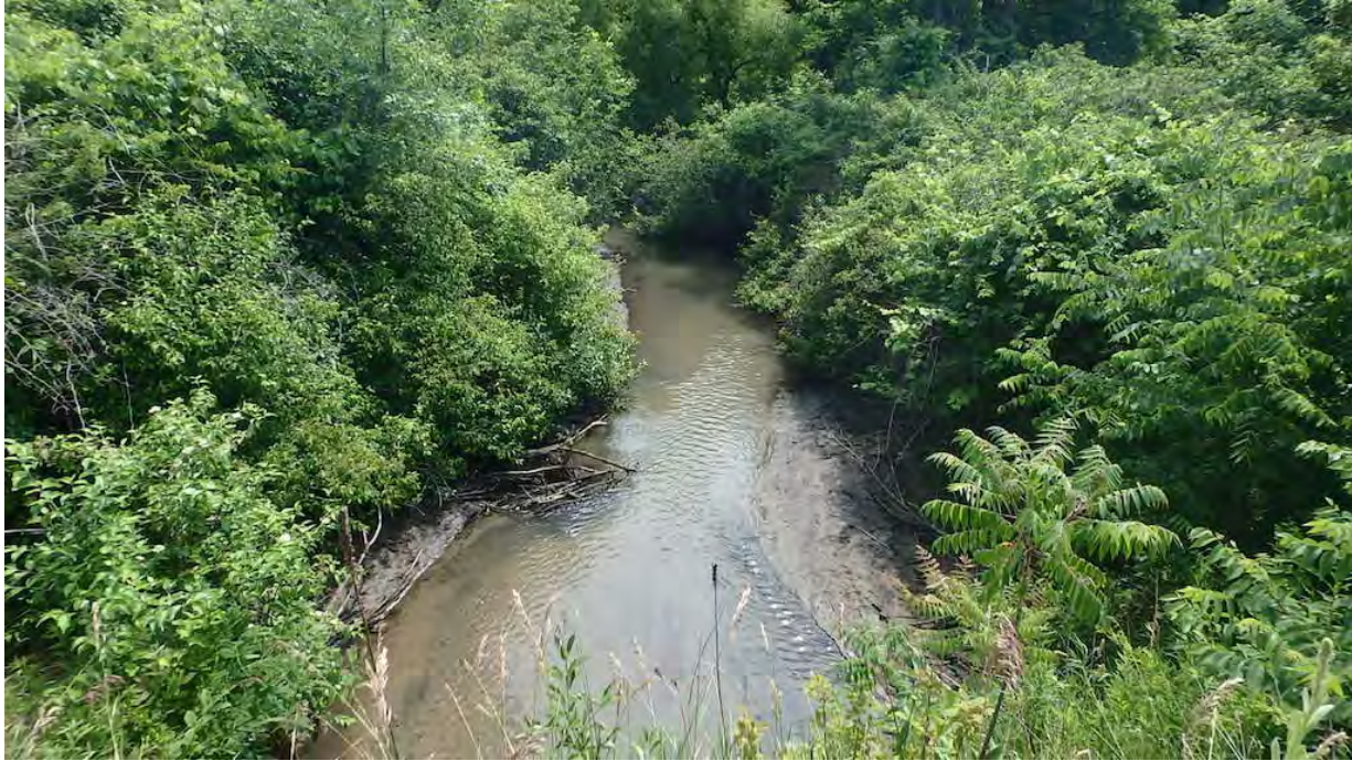
Figure 5 Downstream