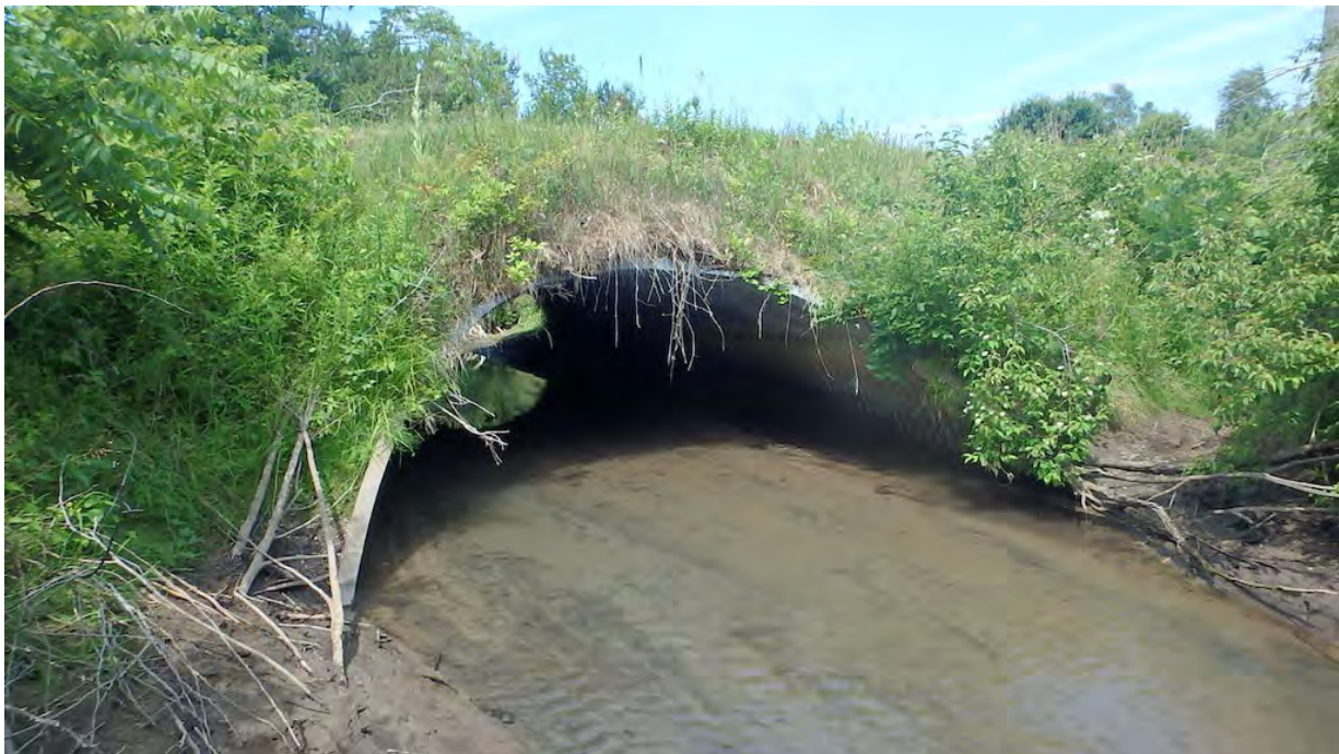
Figure 2 East Profile, Outlet