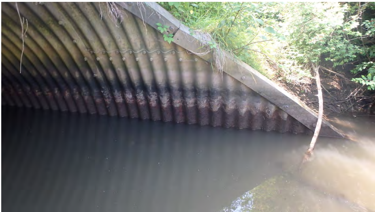
Figure 8 Corrosion at Waterline