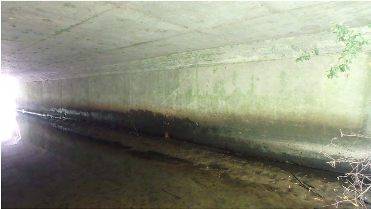
Figure 7 North Barrel Wall, Note Staining