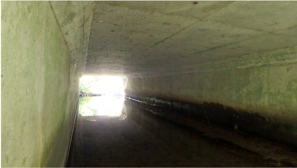
Figure 9 Barrel