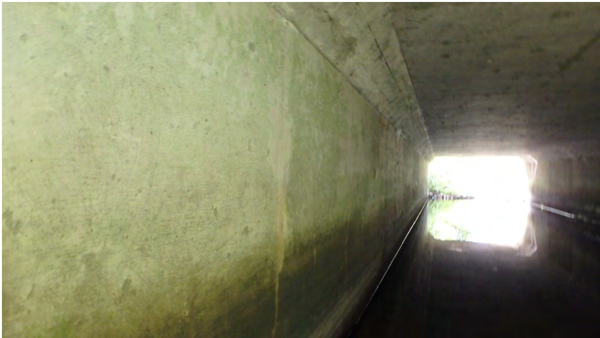
Figure 8 South Barrel Wall, Narrow Vertical Cracks