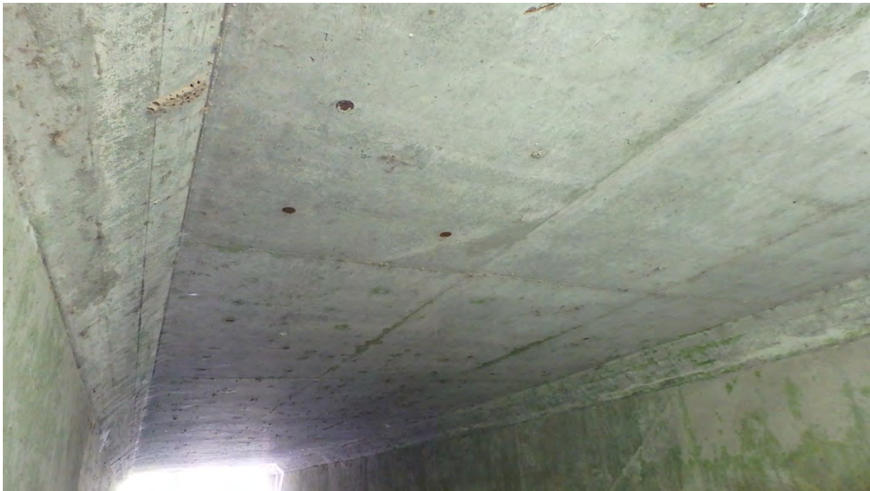
Figure 6 Soffit