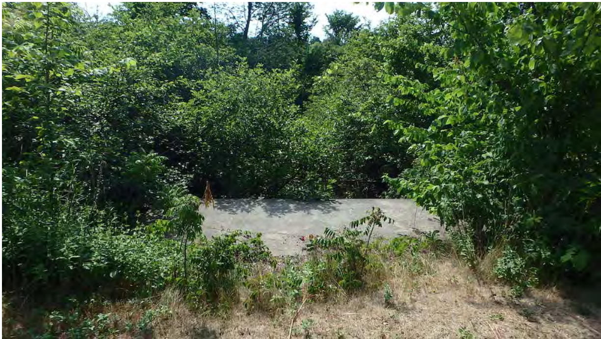
Figure 4 West Culvert Top, Inlet