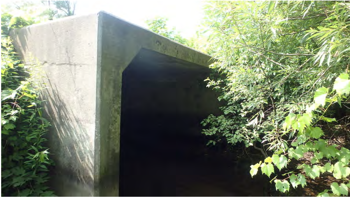
Figure 3 East Profile, Outlet