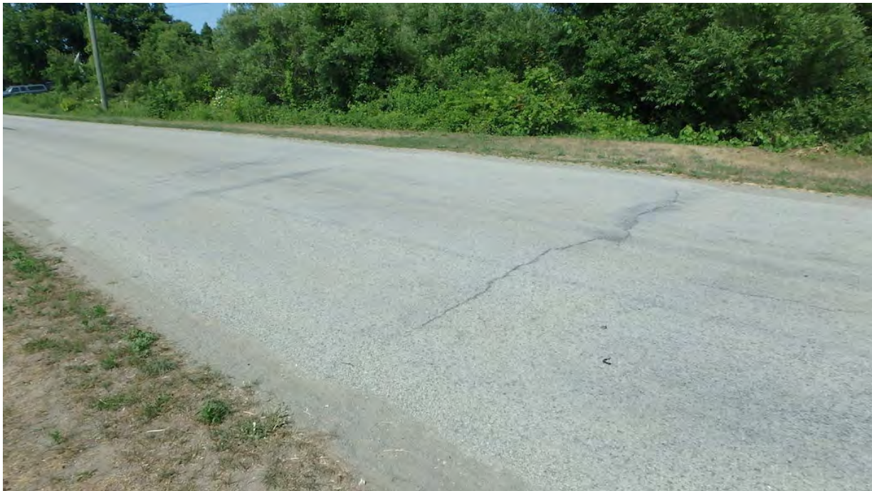
Figure 10 Settlement at Structure Edges