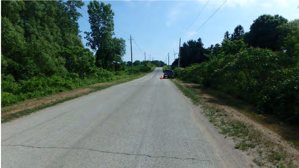
Figure 1 North Approach