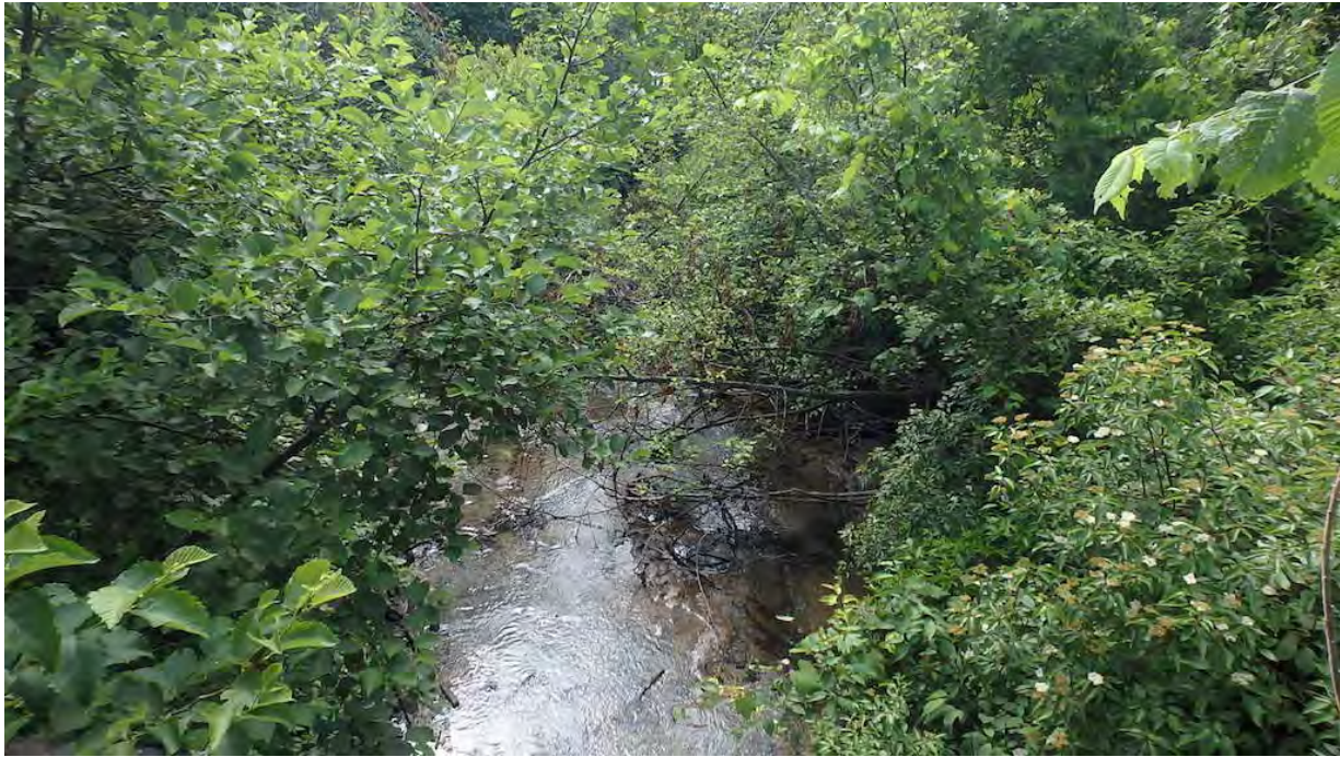
Figure 5 Upstream