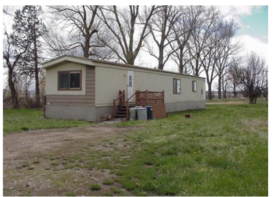
Bunkhouse - Trailer